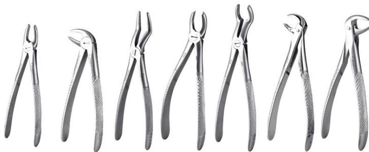
n°1 n°33A n°51 n°65L n°67A n°73 n°74